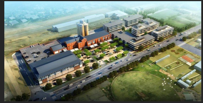
The Mill, Wagga Wagga, NSW

The ICAC Building, Elisabeth St, Sydney CBD NSW