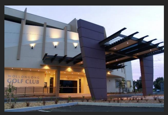
Wollongong Golf Club, Wollongong, NSW